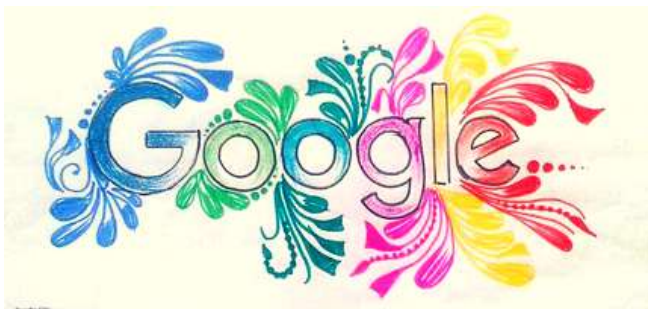
A google doodle drawn by a Hiwep Student