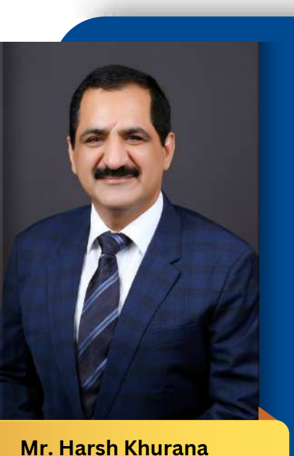
Chief - Regulatory, Corporate Affairs & Communication Department, Huawei Telecommunication, India

Together, NIIT Foundation and Huawei India look forward to bringing a change in people's digital literacy and encouraging employability amongst youth. There is hope that through sessions and Life Skill modules, we can help bring about a cultural change that will be helpful to girls, and women to attain more freedom, independence, and rights.